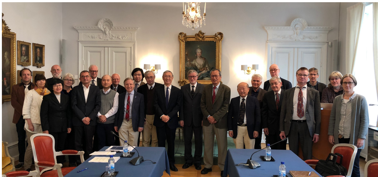
China and the Mediterranean World: The main speakers at the Stockholm Symposium (Oct. 2018)